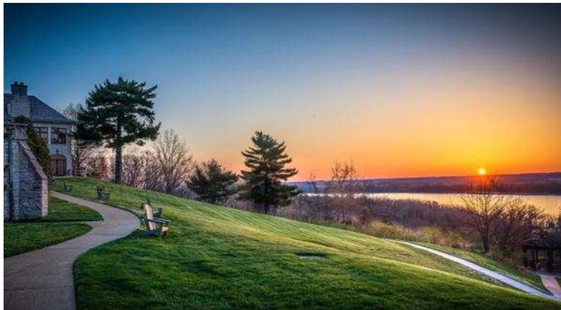
Morning Sunrise at the White House Retreat Center